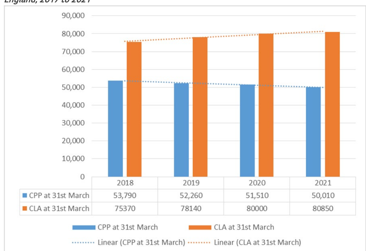
Figure 3. Numbers of Children on Child Protection Plans (CPP) and Children Looked After in England, 2017 to 2021

There are three possible explanations for these findings in the UK. Firstly, countervailing forces may have been significant, with unprecedented government action to support family finances and an upsurge of community based, local action, also evident.