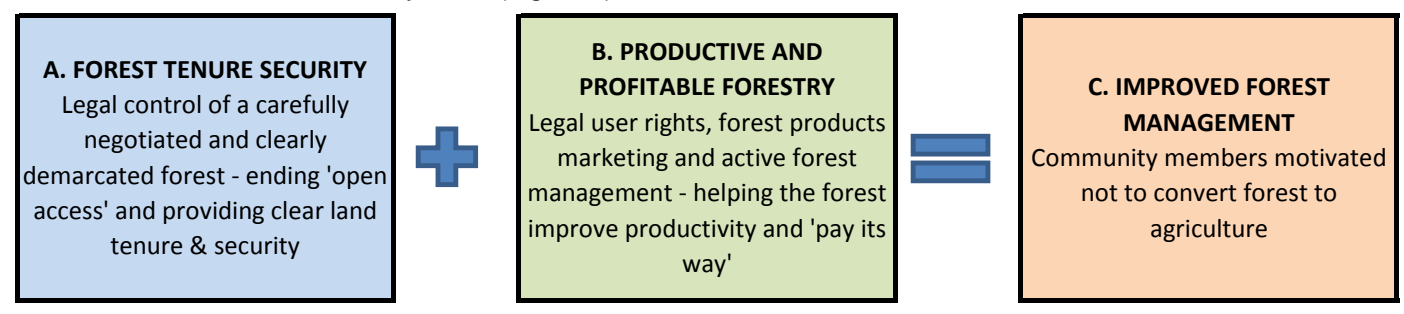
Figure 2. The principles under which PFM operates to ensure improved forest management outcomes

PFM addresses these issues by providing improved user rights and secure tenure through legally signed agreements with government. It also increases the value of the forest through active forest management to improve productivity and forest based enterprise development.