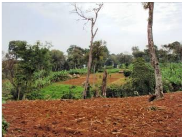
Deforestation for farming near Masha

While the predominant rate of deforestation over the last two decades is less than 2%, the rate in the most recent periods seems to be accelerating to 3% or above. According to the Woody Biomass Inventory & Strategic Planning Project (WBISPP) average annual deforestation is 28,916ha.