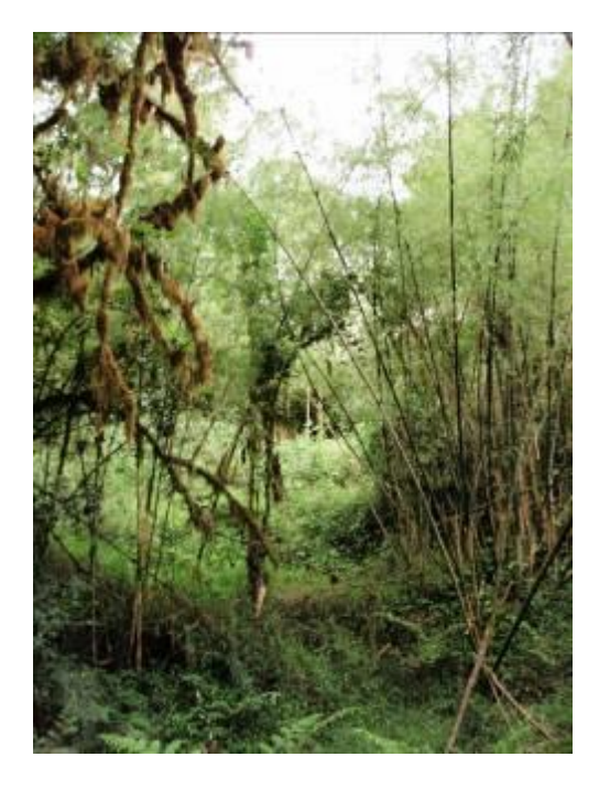
Figure 4. Highland Bamboo (Arundinaria alpina)

Highland bamboo is found above 2,450 masl on a broad plateau in Masha and Anderecha woredas that overlooks the Gambella Lowlands. After a number of years (variously put at between 20 and 50 years) the bamboo flowers then dies in large areas. Recovery takes about 2 to 4 years. Currently, the bamboo is used only locally, mainly for fencing and house construction. Highland Bamboo in the Project area covers some 11,100 ha.