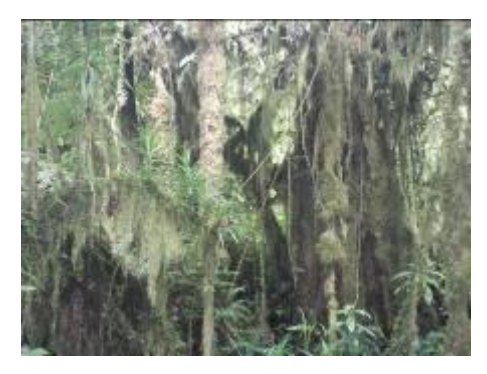
Figure 2. Mosses are abundant in the Cloud Forest