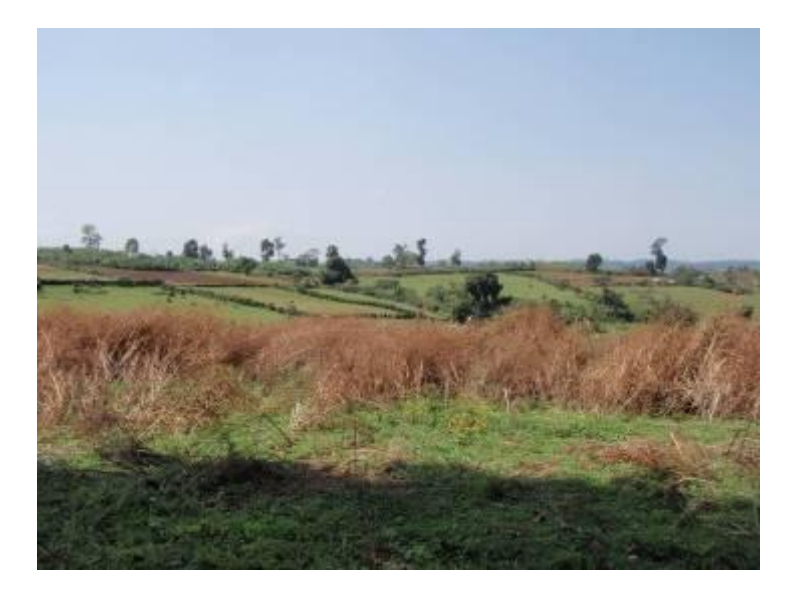
Figure 6. Enset gardens and Fenced Crop and Grassland Fields in Uwa kebelle, Masha Woreda.

Crop and grazing lands are invariably fenced often with Euphorbia spp. and bamboo at higher altitudes. The range of crops is wider than in the south: maize, teff , wheat, barley and pulses. Grazing fields are often individually owned. Many of the livestock are tethered when grazing. The farmers follow a field rotation of 1 year crops, next year grass, followed by crops again. There is also a crop rotation superimposed on the field rotation of maize, pulses, teff and then wheat or barley. Maize trash lines are used in teff fields only, farmers having recognized the higher erosion potential of a teff crop. These systems are extremely efficient in retaining and recycling soil organic matter and nutrients.