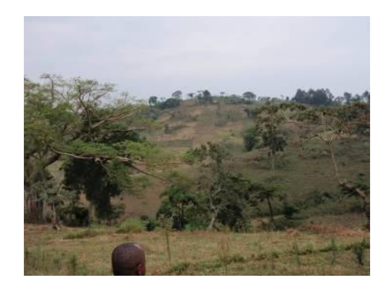
Figure 5. Annual cropland on steep slopes in Shaiyta kebelle, Sheko Woreda. Note Vetiver grass trip in foreground.