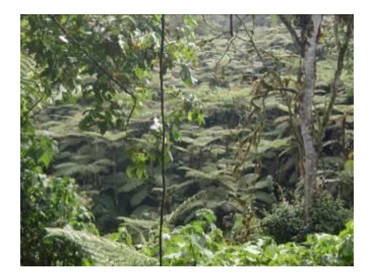
Figure 3. Tree ferns ( Cyathea manniana ) are also very common.