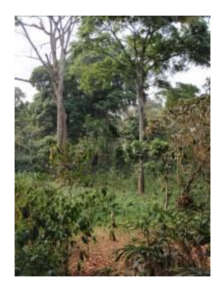
Figure 1. Semi-Forest-Coffee Forest

The three categories of coffee forest were found to differ considerably in the degree of human alteration of the original wild coffee forest and thus in terms of their relative importance for conservation of their coffee gene pool.