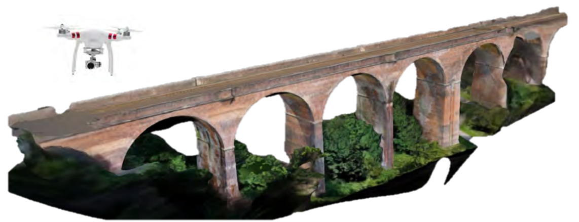
(b) Aerial photogrammetry of a railway viaduct