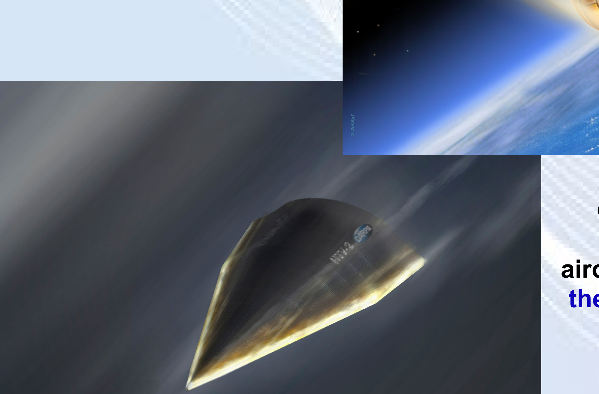
UHTCs are the key candidates for the new generation hypersonic aircraft and re-entry vehicles thermal protection systems